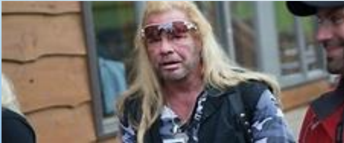
Dog the Bounty Hunter